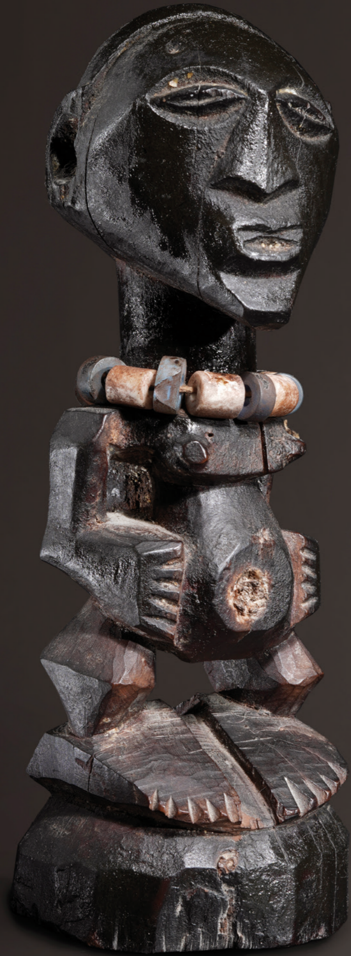
1 Songye nkisi Figure, DRC H. 24cm

Collection History: From an old Swiss private collection