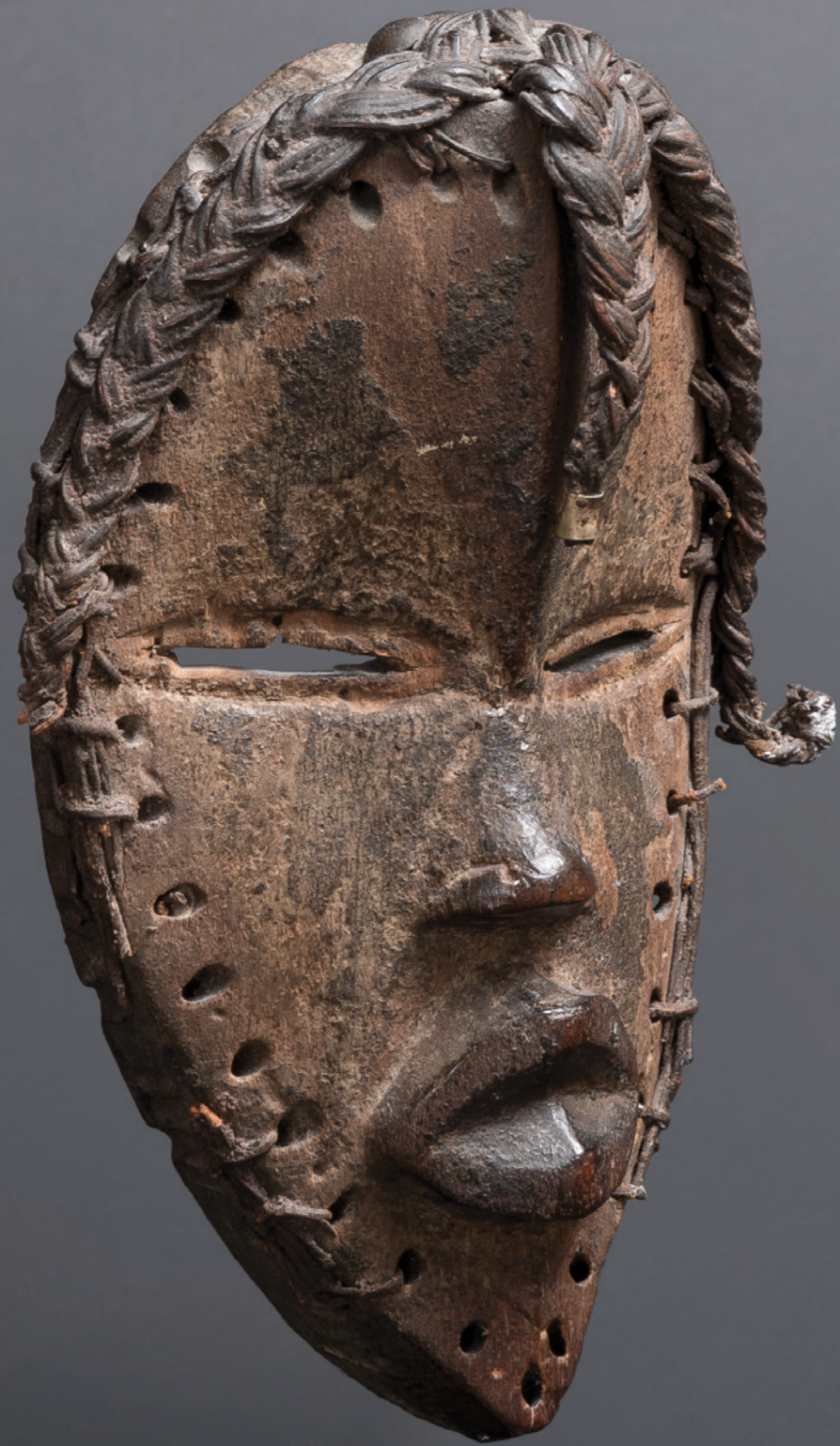
5 Dan miniature Mask, Ivory coast H. 15cm