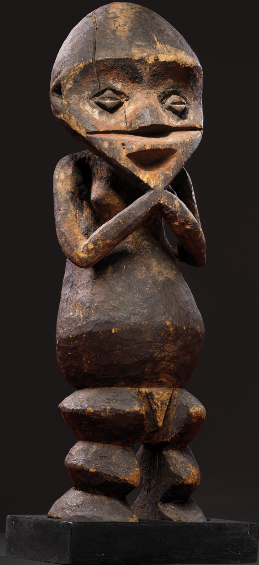
Mambila tadep Figure Eastern highland region of Nigeria H. 40cm