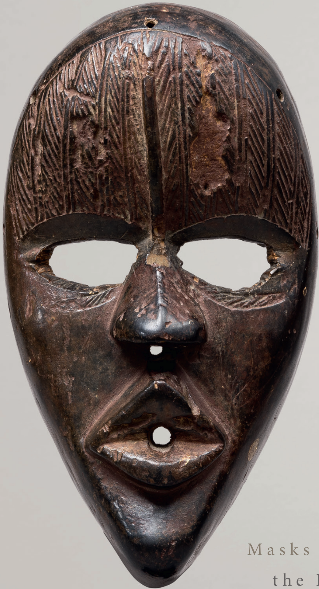
Masks of the Dan