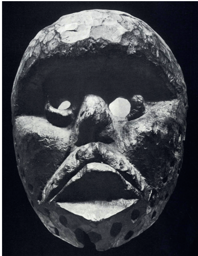
Mostra D'Arte Primitiva Africana, 1972