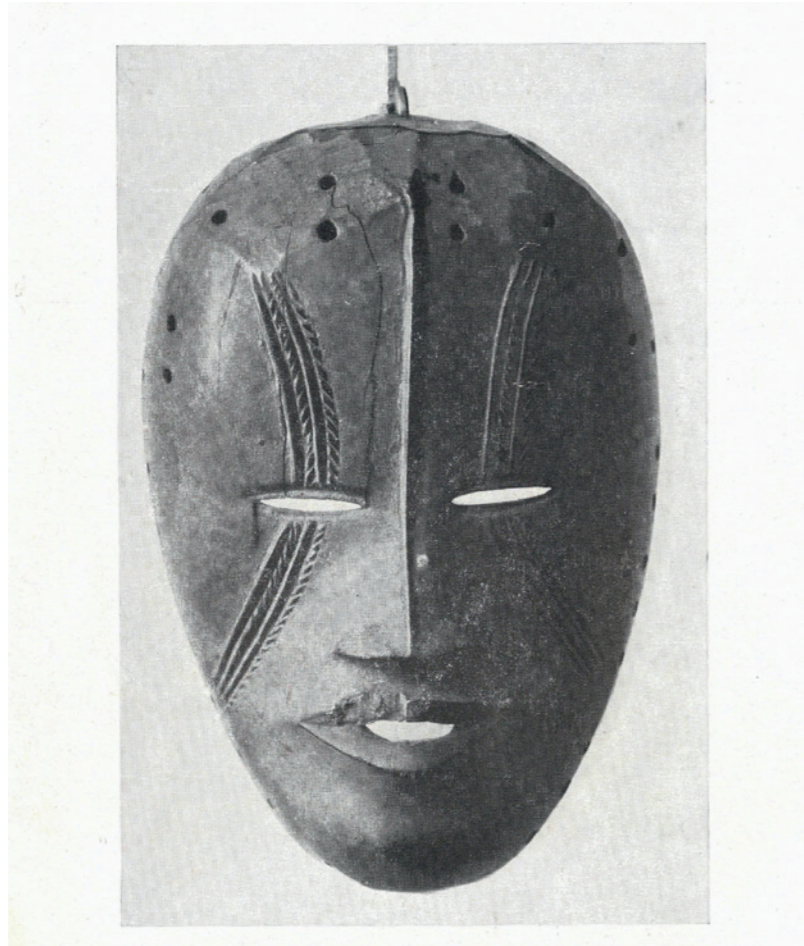
Galerie Percier, Catalogue D'Objets D'Art Nègre , 1933