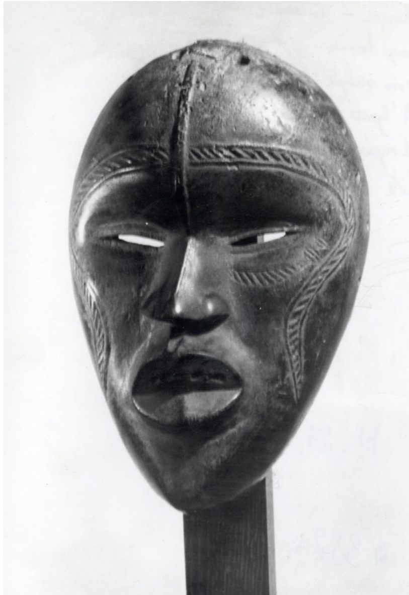
Archive-Photo from the Pierre Vérité Gallery