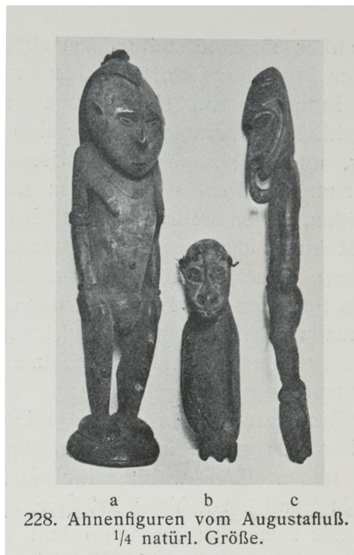
The Flying Fox sculpture illustrated in Richard Neuhaus's Deutsch Neu-Guinea Band 1 , 1911