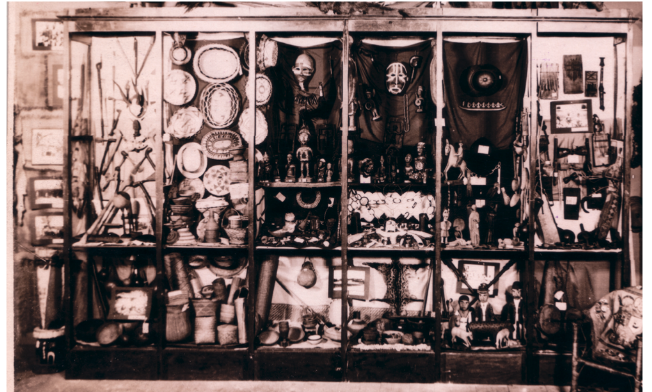
The Kongo mask on view in the vitrine of the Congrégation du Saint Esprit during the Exposition Missionnaire Internationale du Vatican

Exhibited in Rome during the Exposition Missionnaire Internationale du Vatican in 1925, this captivating Kongo mask is one of the very early masks of that region brought to Europe. Exceedingly well-documented and of historic origin, it is a very powerful Kongo mask with a fascinating appeal, painted with the characteristic black, white and red pigments. Its history was only recently made accessible anew by Nicolas Rolland's careful publication Afrique à l'ombre des dieux , in which an exhibition picture of the Vatican show is depicted, where the impressive mask is centrally displayed in its showcase.