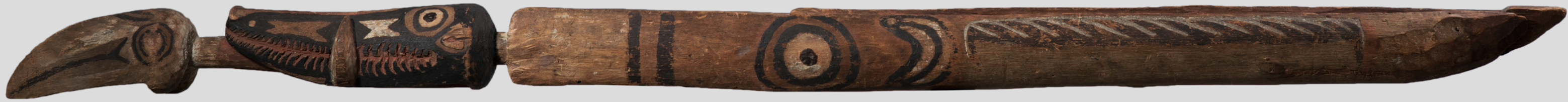
Gogodala ceremonial canoe gi gawa Gulf of Papua, Papua New Guinea Late 19 th –first quarter of the 20 th century Wood, pigments L. 132.5cm