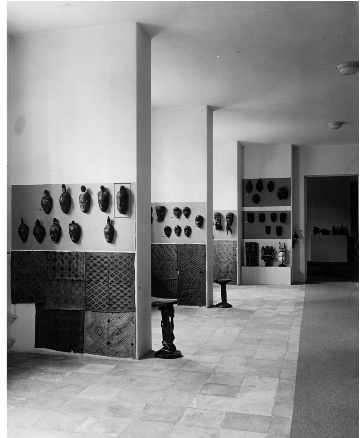
The Guro masks on view in the Munich exposition of 1931

In 1931 a selection of Coray's important collection was exhibited in the Völkerkundemuseum in Munich, a historic exhibition that offered a significant over-view on the Art of Africa. As can be seen on the picture on the right, part of that historic exhibition was this Guro mask.