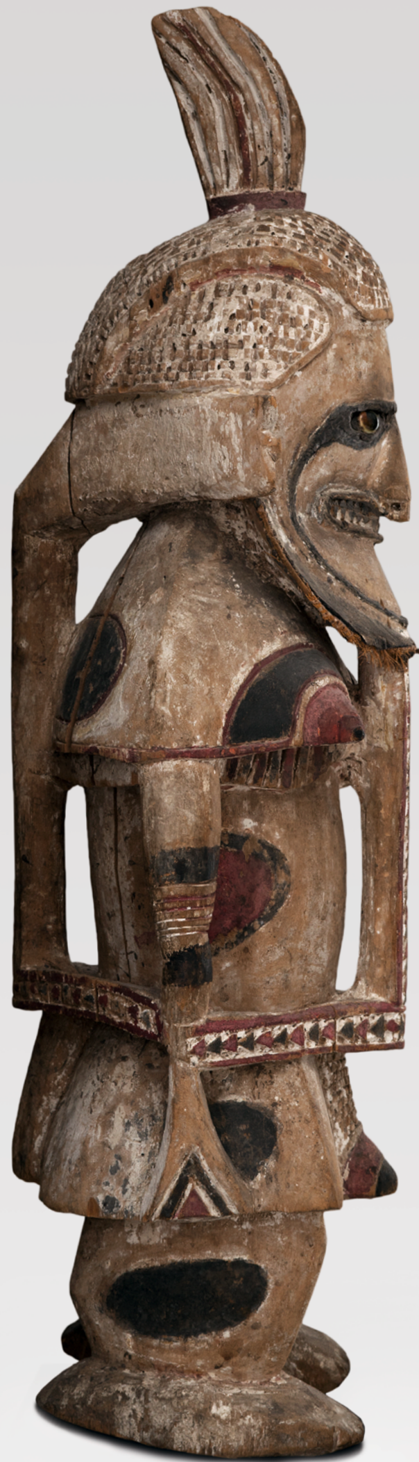
Illustrated as frontispiece and on page 20 Uli Ancestor Sculpture 19 th century H. 94cm