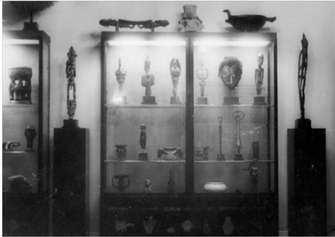
The Flying Fox Sculpture on view in the apartment of Walter Bondy, Paris, c. 1930

Flying Fox Sculpture Lower Sepik River, Papua New Guinea 19 th century Wood, pigments H. 25cm